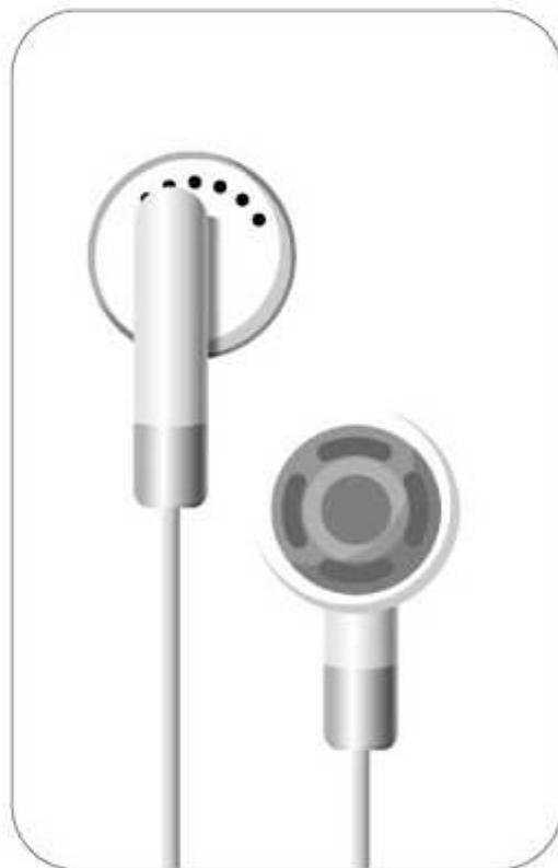
The iDea Earphones and other stylish iDea accessories are tailor-made for the iPod™.